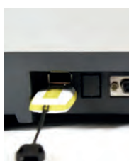
RS232 output and USB