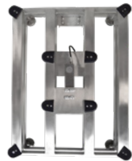
V3 Load cell in stainless steel.