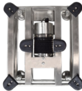
V2 The load cell in aluminium is covered by a rubber protection.