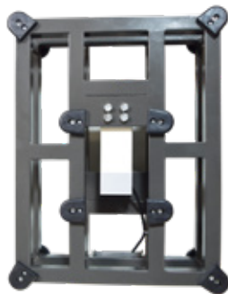
V1 Load cell in aluminium.