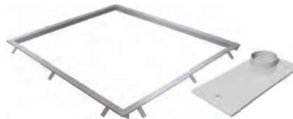
Stainless steel in-built frame