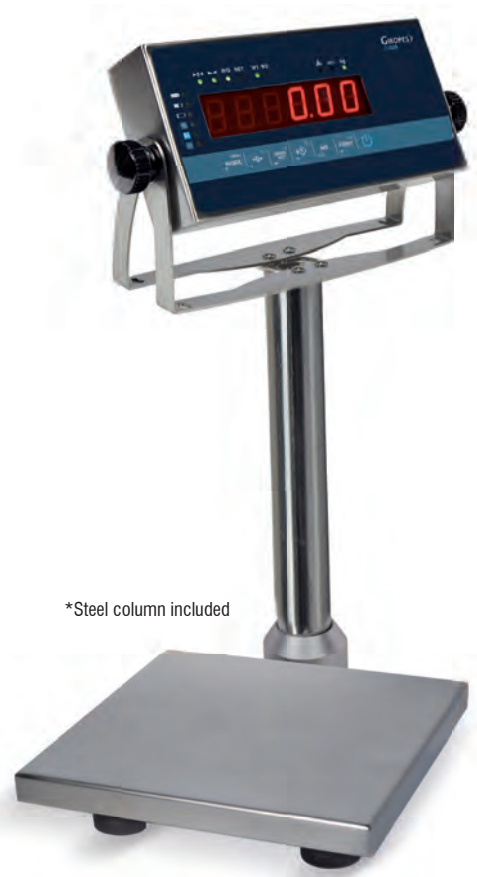
*Steel column included