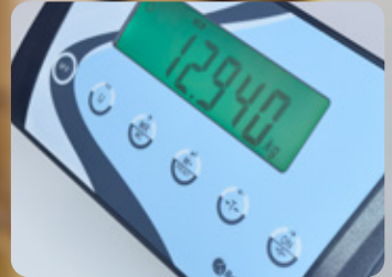
LCD indicator in ABS with 100h internal battery duration without interruption