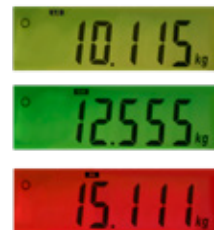
Colour-contrast checkweighing function