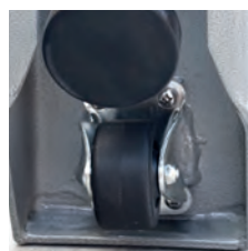
Wheels for transport