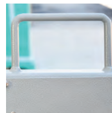
Lifting handle for transport