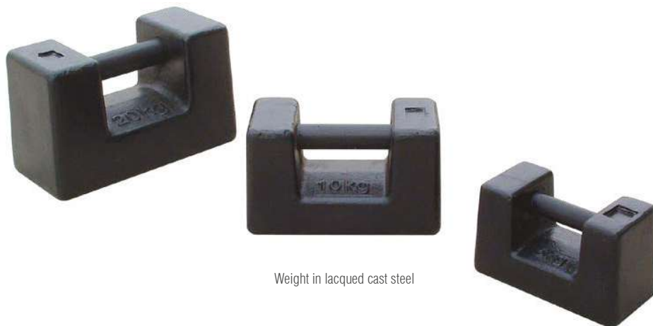
Weight in lacqued cast steel