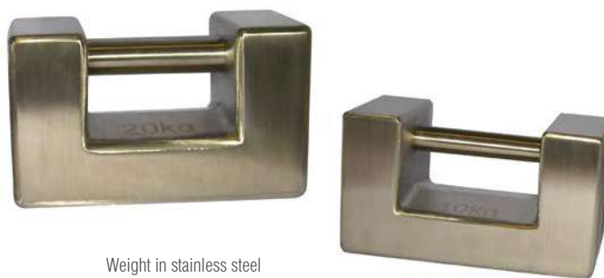
Weight in stainless steel