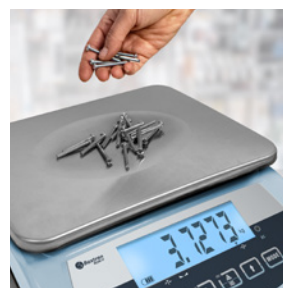
Piece counting function